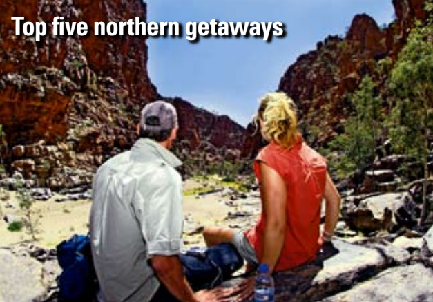
Top five northern getaways

WIN AN ENGEL FRIDGE WORTH $1 199! • WIN A DRIFTA KITCHEN WORTH $699!