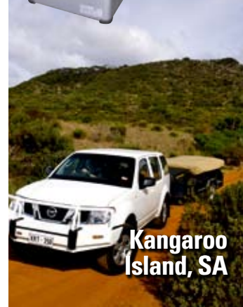
Kangaroo Island, SA