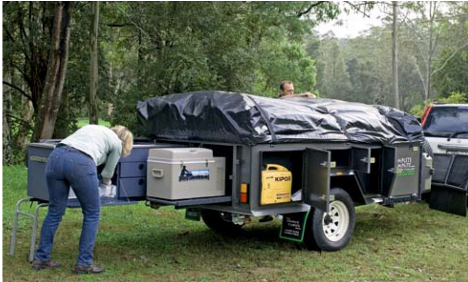
Clockwise from above: The slide-out kitchen is a steady, sturdy unit; fold down the stairs to reveal six drawers and the walk-in storage space at the foot of the bed; there's a large lockable toolbox up front; large windows keep the area illuminated when the awning is set up.